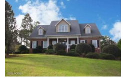
164 Baker Circle West End NC