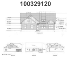
224 Longleaf Drive West End NC