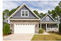
165 Heath Court West End NC