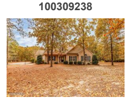
137 Longleaf Drive West End NC