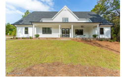
186 Longleaf Drive West End NC