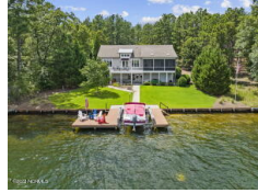
135 Vanore Road West End NC