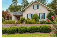
124 Callis Circle West End NC