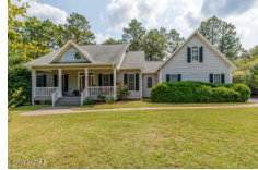
420 Longleaf Drive West End NC