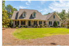
101 Forest Square Lane West End NC