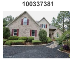
105 Ritter Drive West End NC