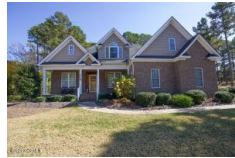
218 Finch Gate Drive West End NC