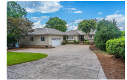
108 Barnes Point West End NC