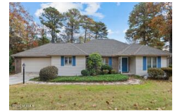
140 Heron Drive West End NC