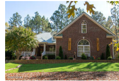
120 James Drive West End NC