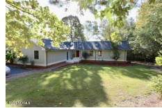
104 Tucker Court West End NC