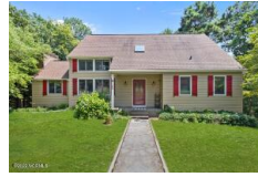
163 Devonshire Avenue W West End NC