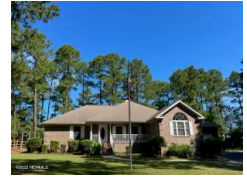
162 Devonshire Avenue W West End NC