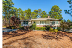
109 Winsford Circle West End NC