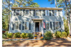
111 Oxford Court West End NC