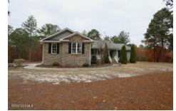
152 Winsford Circle West End NC