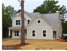
125 Winsford Circle West End NC