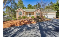
242 Firetree Lane West End NC