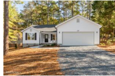
135 Sunset Way West End NC