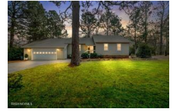
106 Juniper Court West End NC