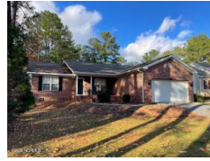
194 Firetree Lane West End NC