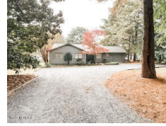
172 Overlook Drive West End NC