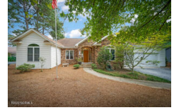
104 Fox Run Court West End NC