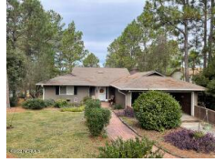
122 Cardinal Lane West End NC