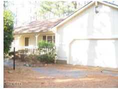
114 Shenandoah Road W West End NC