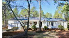
124 Edgewater Drive West End NC