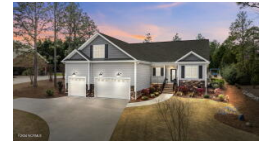
135 Swaringen Drive West End NC