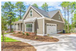
337 Longleaf Drive West End NC