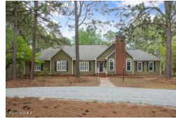
259 Longleaf Drive West End NC