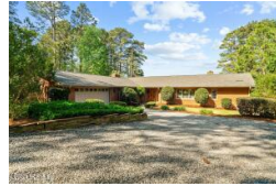
137 Owens Circle West End NC