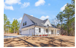
186 Longleaf Drive West End NC