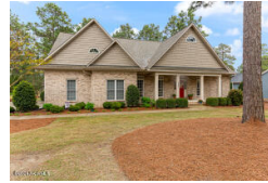
157 Longleaf Drive West End NC