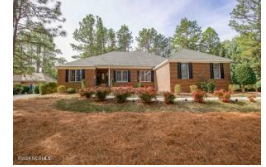
106 Morris Drive West End NC