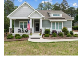
222 Finch Gate Drive West End NC