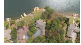
131 Vanore Road West End NC