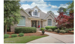
108 Christine Place West End NC