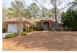
234 Finch Gate Drive West End NC