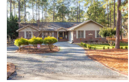
290 Longleaf Drive West End NC