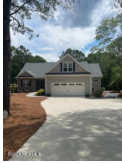
139 Longleaf Drive West End NC