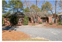
333 Longleaf Drive West End NC