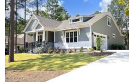
276 Longleaf Drive West End NC