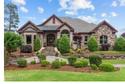
117 Andrews Drive West End NC