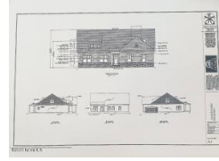
107 Beacon Ridge Drive West End NC