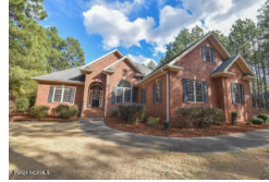
255 Longleaf Drive West End NC