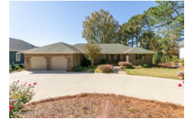
104 Butterfly Court West End NC