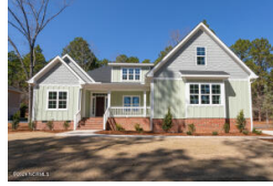
110 Vanore Road West End NC