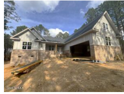
512 Longleaf Drive West End NC