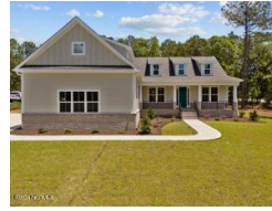
114 Carriage Park Drive West End NC