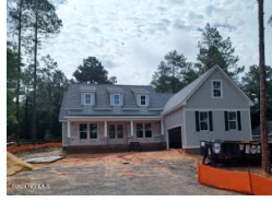
115 Simmons Drive West End NC