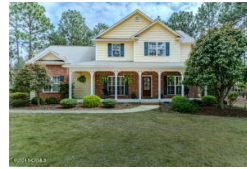
102 Dubose Drive West End NC