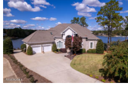
107 Gordon Point West End NC