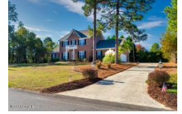
133 Swaringen Drive West End NC