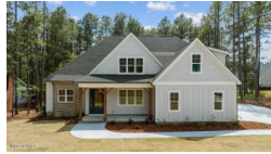
529 Longleaf Drive West End NC