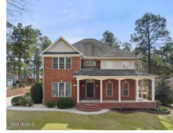
113 Clay Circle West End NC