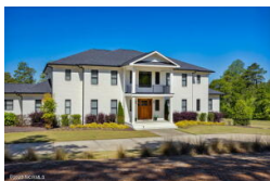
410 Morganwood Drive West End NC