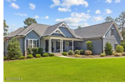
126 Morgan Trail Court West End NC