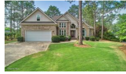
119 Dennis Circle West End NC