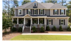
111 Clay Circle West End NC