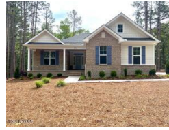
496 Longleaf Drive West End NC