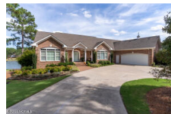
118 Dennis Circle West End NC