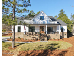
126 Shaw Drive West End NC