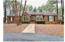
236 Longleaf Drive West End NC