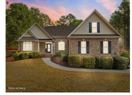
114 Andrews Drive West End NC