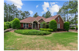
170 Baker Circle West End NC