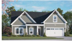
125 Lancashire Lane West End NC