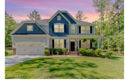
246 Devonshire Avenue W West End NC