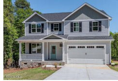
111 Lancashire Lane West End NC