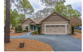
131 Devonshire Avenue W West End NC