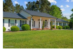
138 W Shenandoah Road West End NC