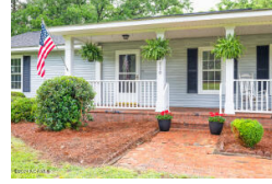
110 Shenandoah Road W West End NC