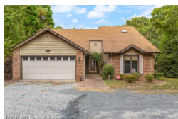
102 Firetree Lane West End NC