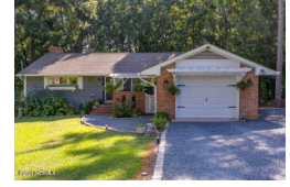
159 Edgewater Drive West End NC