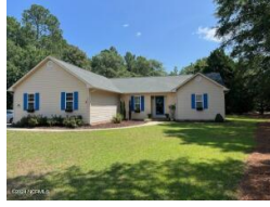
109 Stallion Drive West End NC