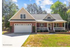
103 Sandspur Lane West End NC