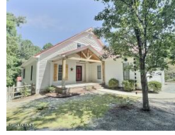
103 Juniper Court West End NC