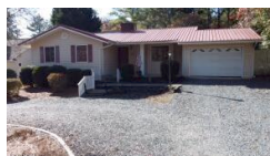
102 Dogwood Lane West End NC