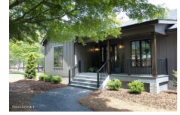
101 Fawn Court West End NC