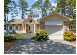
135 Edgewater Drive West End NC