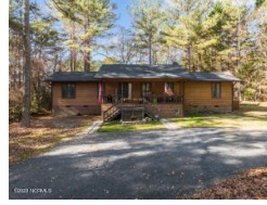
112 Primrose Circle West End NC