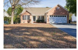
147 Sunset Way West End NC