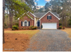
112 Pinecone Court West End NC