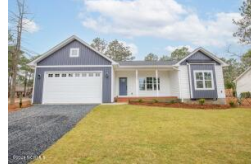
101 Seminole Court West End NC