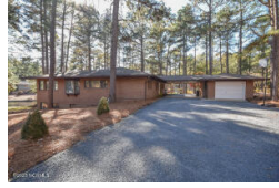
104 Amberwood Court West End NC