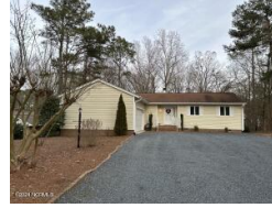
161 Edgewater Drive West End NC