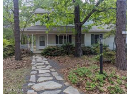
101 Rolling Hill Court West End NC