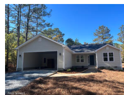
120 Sandspur Lane West End NC