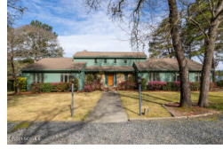
110 Cobblestone Court West End NC