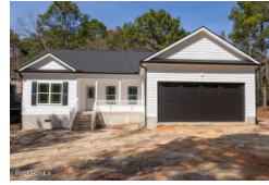
104 Pleasant View Lane West End NC