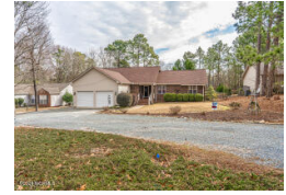
109 Sandspur Lane West End NC