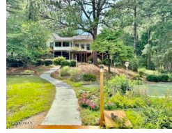
137 Pleasant View Lane West End NC