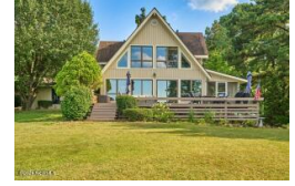
102 Calmwater Lane West End NC