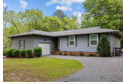
104 Scuppernong Court West End NC