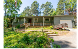
106 Cottage Grove Lane West End NC