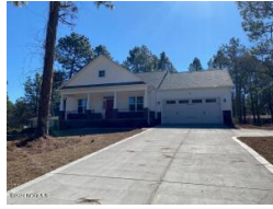
101 Cherokee Trail West End NC