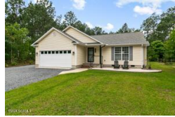
114 Dogwood Lane West End NC