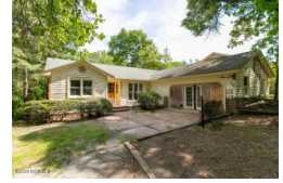
144 Cardinal Lane West End NC