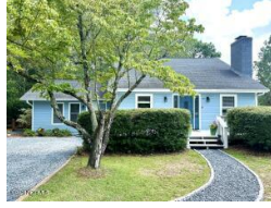
134 Shenandoah Road E West End NC