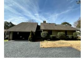
174 Overlook Drive West End NC